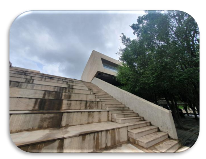
Informal Gathering Spaces for Students

FLAME University is a private university, with 31 institutional and administrative buildings, including a sports complex, amphitheater. The campus is vibrant with four cafes and three water bodies. It is spread on 53 acres of green expanse.