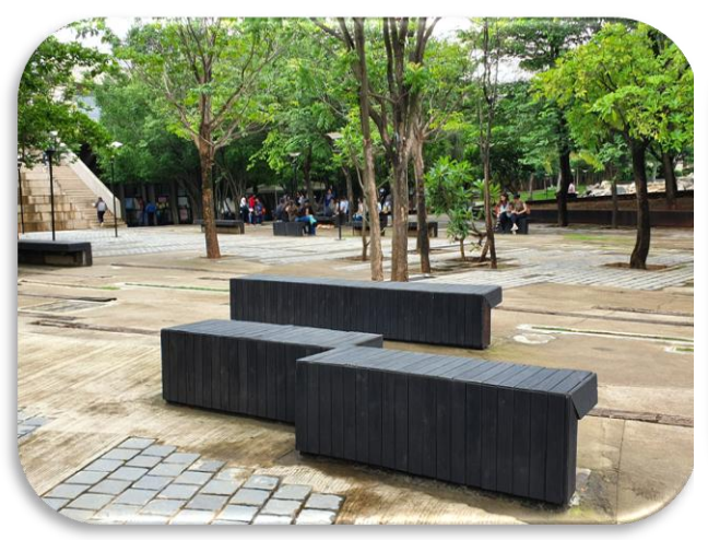
Interactive Seating in front of Library

FLAME University is a private university, with 31 institutional and administrative buildings, including a sports complex, amphitheater. The campus is vibrant with four cafes and three water bodies. It is spread on 53 acres of green expanse.