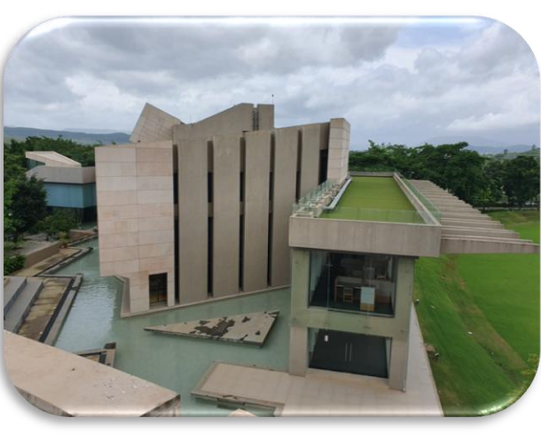
Overview Of Library Building